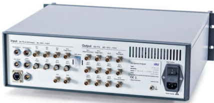
High-performance electrical unit for acquiring and processing all data