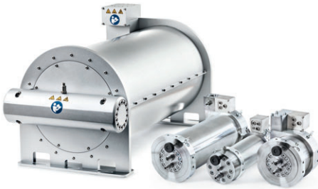
The complete IAV Cross – Injection Analyzer family for all kinds of applications